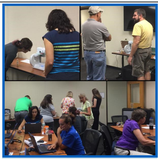
Out and About:: 3D Printing Workshop this summer!